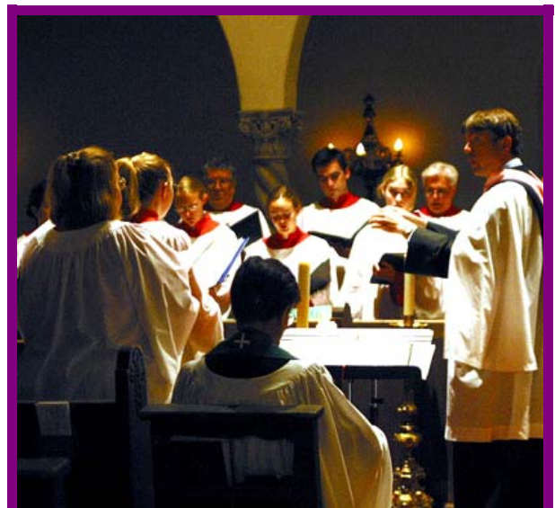
Choral Evensong presented at St. Philip's-in-the-Hills Episcopal Church, Tucson, AZ.

The service will conclude with a Hymn Festival of several congregational hymns suggested, in part, through a survey of parishioners from the four participating churches. A Reception will follow.